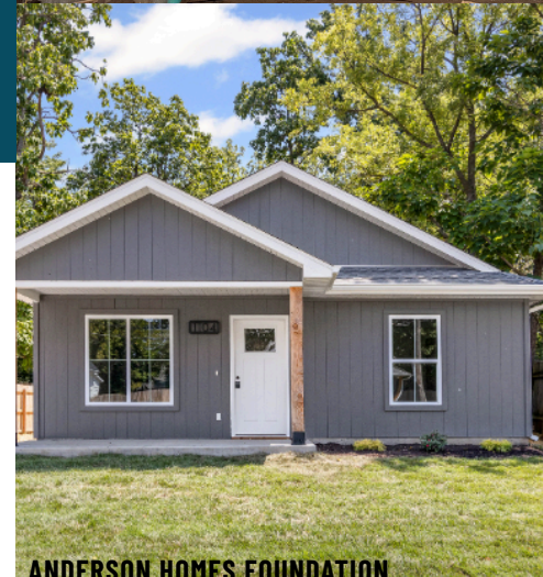
ANDERSON HOMES FOUNDATION