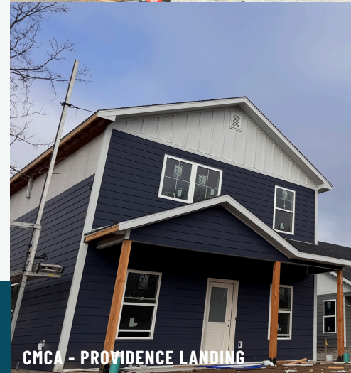
CMCA - PROVIDENCE LANDING