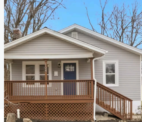
ARISE DWELLINGS - AFFORDABLE HOUSING