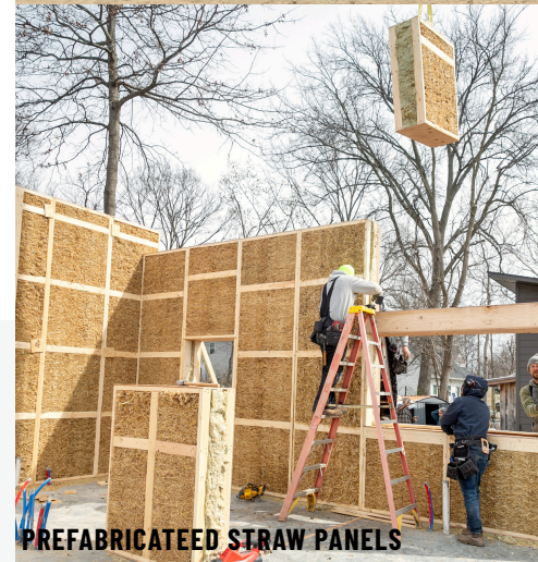
PREFABRICATED STRAW PANELS